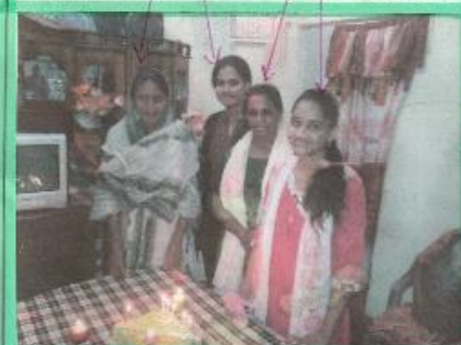
My mother's sister and her daughter.